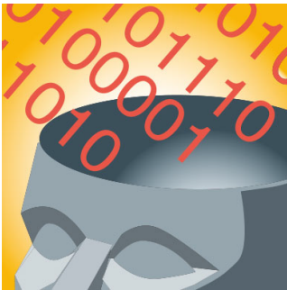
Unique DataWizard Premium

In addition to the audio and visual user feedbacks, an optional Vibrator is also available for tactile confirmation of good read. It's ideal for quiet and noisy environments like hospital, library, and manufacturing plants. Especially for healthcare application, the vibration will notify the caregiver that a barcode is captured properly without disturbing patients.